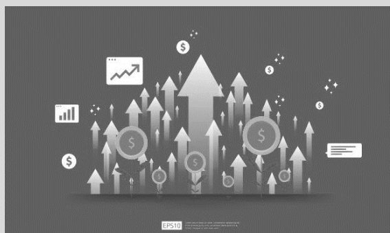
Orders and status