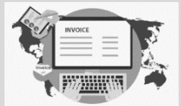
Payments & Delivery